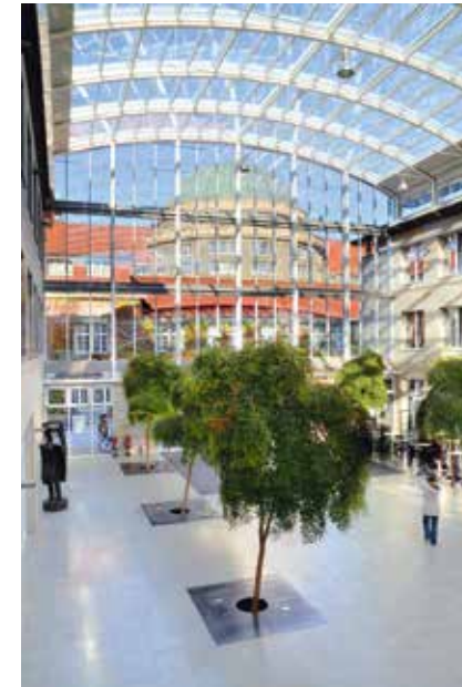
Asien-Afrika-Institut Edmund-Siemers-Allee 1 (Flügel Ost)