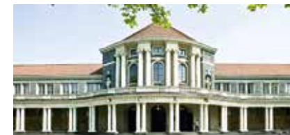
Universität Hamburg Edmund-Siemers-Allee 1